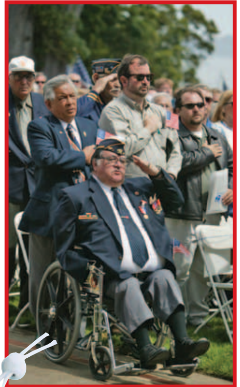
Advanced Speak and Listen Feature/Increased Range and Clarity