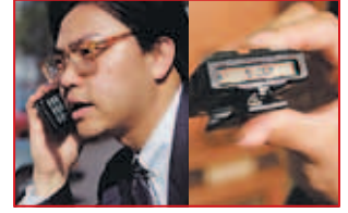
+ Cellular phones and pagers