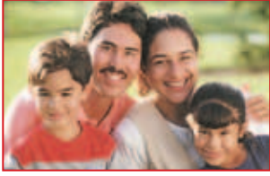
+ Family or neighbors