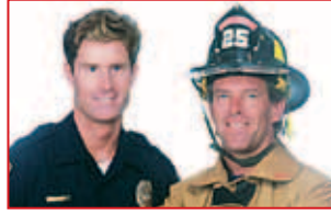
+ Emergency services (local regulations permitting)