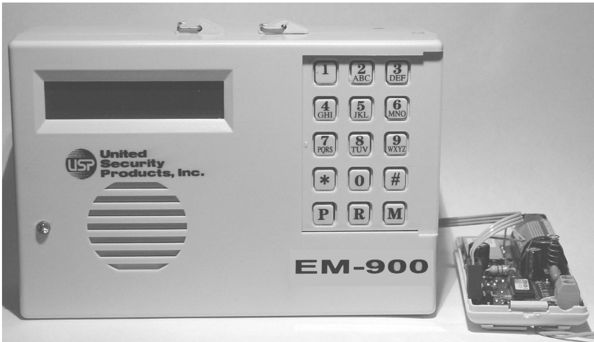
Figure 1 - Typical cable connection to a universal transmitter with cover off.