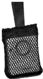
Mesh Bag Included

With the Patient Alert still in the off position, attach the unit to the bed-rail, to the back of the bed or to a leg of the bed using the Mesh Bag provided. It is recommended to mount the unit facing away from the patient as Patient Alert sound is designed to alert caretaker while alerting patient to return to bed.